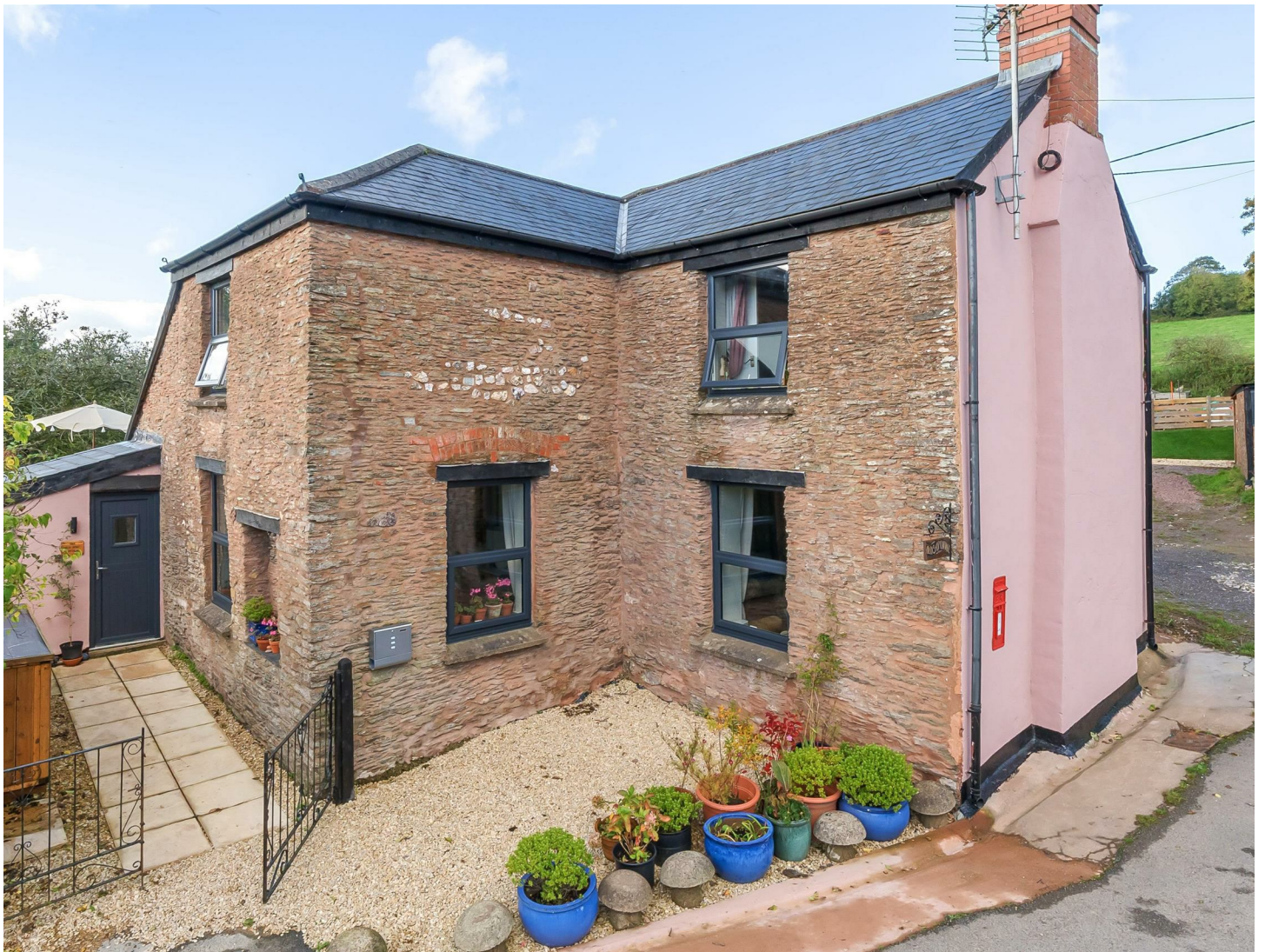
The Old Shop Cottage